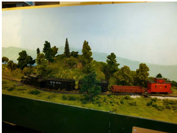
"Forney – rear"