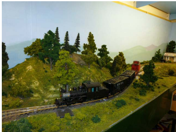
"Forney – front"